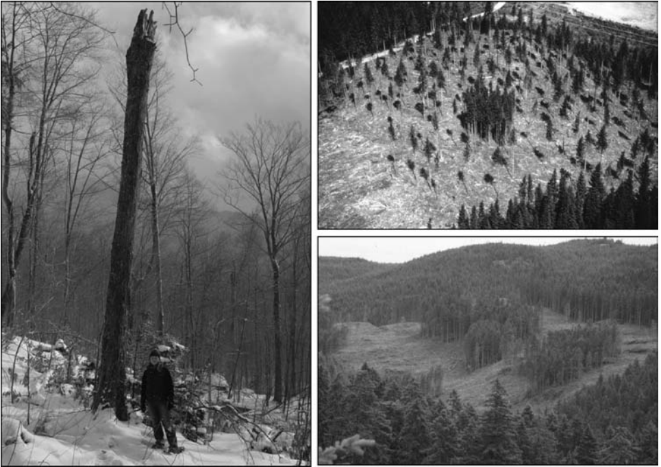
Figure 2. Examples of disturbance-based silvicultural practices. A group selection cut with retention (both live and dead trees) within small (0.05-ha) harvested patches on the Mount Mansfield State Forest in Vermont (northeastern U.S.) is shown to the left. This system approximates the fine-scale canopy disturbances and spatially heterogeneous tree mortality patterns typical of the region's natural disturbance regime (see Keeton 2006). To the right are examples of both dispersed and aggregated retention in the U.S. Pacific Northwest. These practices provide functions similar to those associated with biological legacies left by natural disturbances (see Franklin et al. 2002). They differ from conventional even-aged systems (e.g., shelterwood) in that residual trees are retained either permanently or over multiple rotations.

by natural disturbances, such as greater tree survivorship within riparian areas in areas burned by wildfire (Keeton and Franklin 2004).