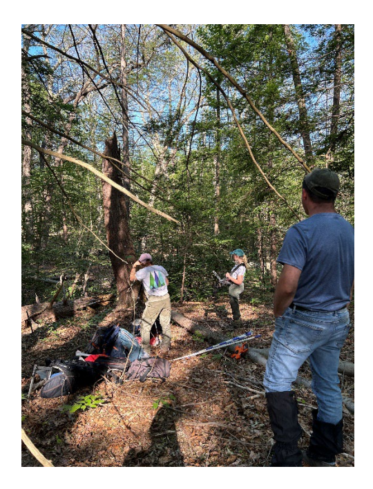
Figure 3. Black Rock Forest staff work with National Park Service vegetation crew to better understand standardized field methods.

After thorough discussions and reviews, we decided that the National Park Service protocol is the best fit for Black Rock Forest because they support regional comparisons, plot sizes are manageable and similar to our existing series of plots, and methods are well-documented. We sent our staff in June 2024 for two days of training with the National Park Service field crews at Roosevelt-Vanderbilt National Historic Site in Hyde Park, NY (Figure 3).